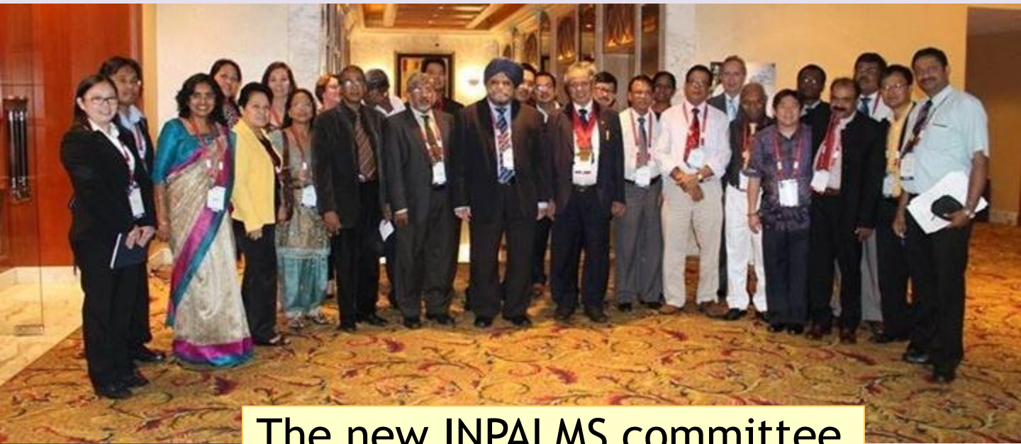
The new INPALMS committee