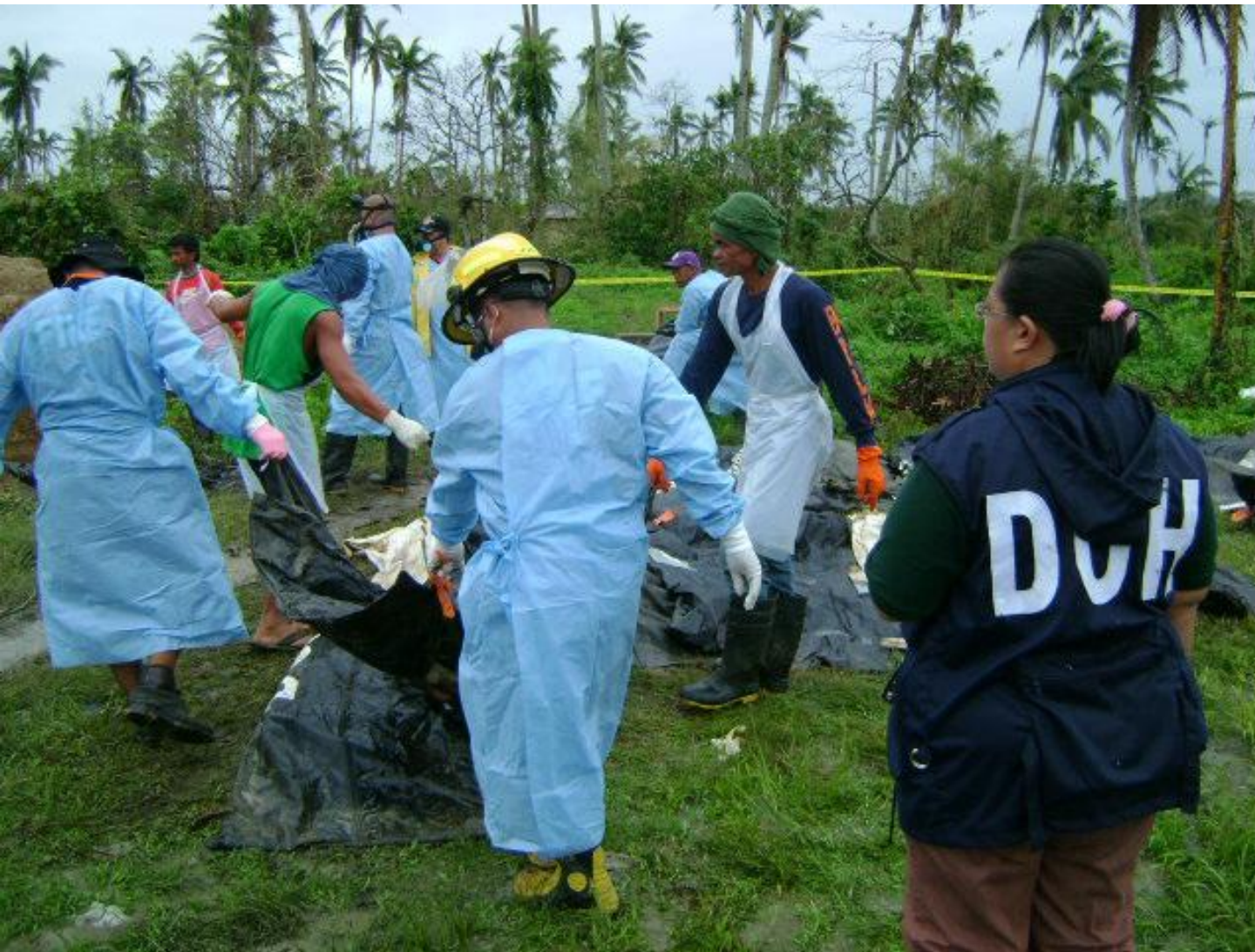
Picture: The aftermath of Yolanda/Hayan in the Philippines